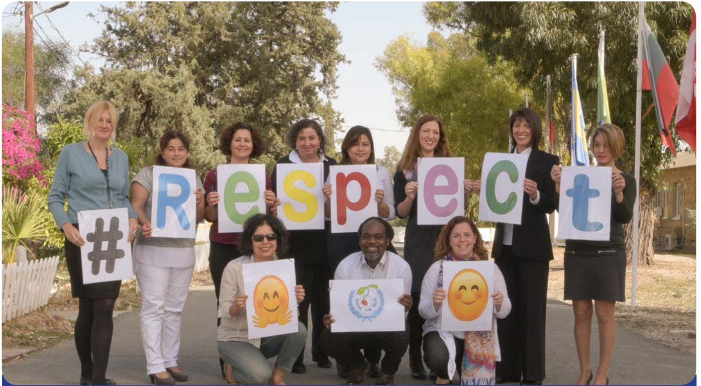
Members of the Inside the Blue team, who conducted the Mission's first-ever #Respect Campaign in November 2017